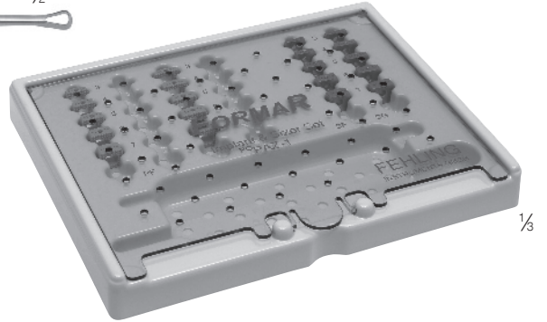
STORAGE AND STERILISATION TRAY FOR CAGES + SIZERS LAGER- UND STERIBEHÄLTER FÜR CAGES + SIZERS